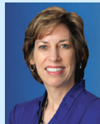
Ellen Ochoa, Ph.D. Astronaut and Director of NASA Johnson Space Center (Retired) NASA Houston, Texas