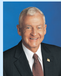
General Dennis J. Reimer 33rd Chief of Staff (Retired) United States Army Chairman Army Emergency Relief Arlington, Virginia Chairman American Armed Forces Mutual Aid Association Fort Myer, Virginia